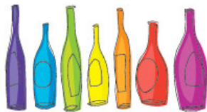
bottles & brushes paint, drink & be merry

Prodigy Glassworks , now located in the heart of the Oak Park Arts District at 207 Harrison St., is offering beginner glass blowing classes for adults & children ages 12+. Beginner classes are on Tuesdays from 6-9 pm and Saturdays from 10 am-1 pm. Cost is $150 per person. Info: 708-445-8000, info@prodigyglassworks.net , www.prodigyglassworks.net .