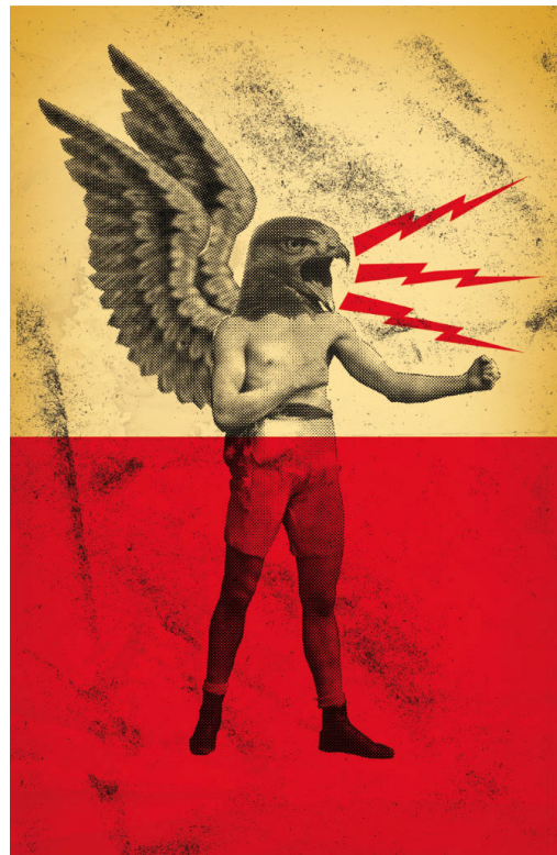
Kid McCoy ↑