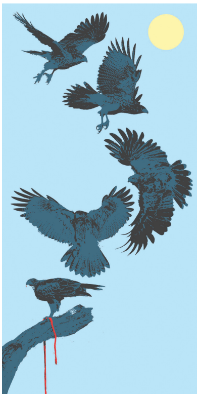
5 Hawks ↑

Feel free to contact him at chicagoninja4.com