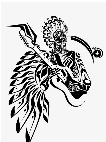
Little Wing ↑ Detail →